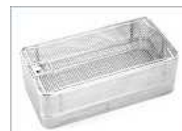
OSC 09DJ 104G